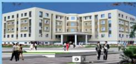
Proposed Medical College